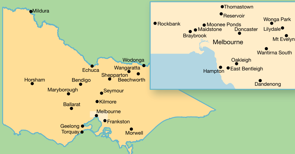
Areas visited by the Commissioner and staff of the OCSC in order to hear from children, their families and carers and organisations which support them.

kinship carers and kinship care staff. In addition to visits to children and their carers in out-of-home care services, the Commissioner has also visited other community organisations providing important services to children, such as the innovative Wendouree West Community Learning Hub.