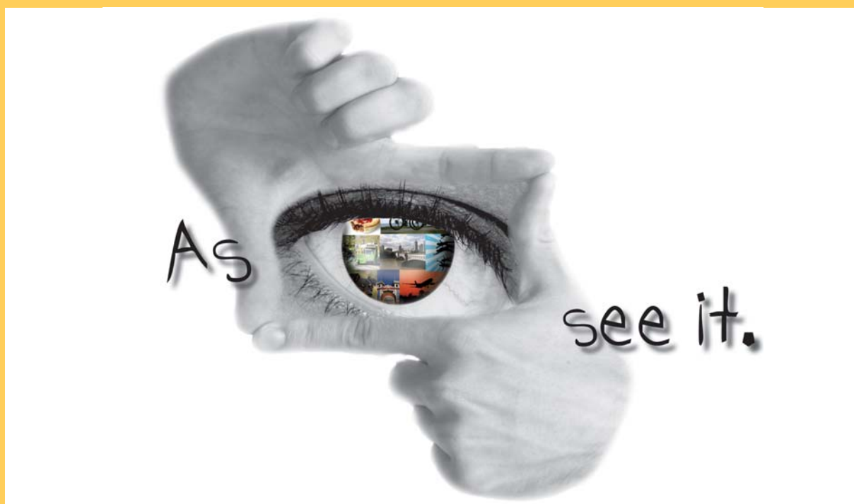
Image from the poster used to promote the exhibition, As I See It .

The As I See It project was delivered through a partnership between the OCSC, ten non-government organisations and the Department of Human Services. A report from the project is