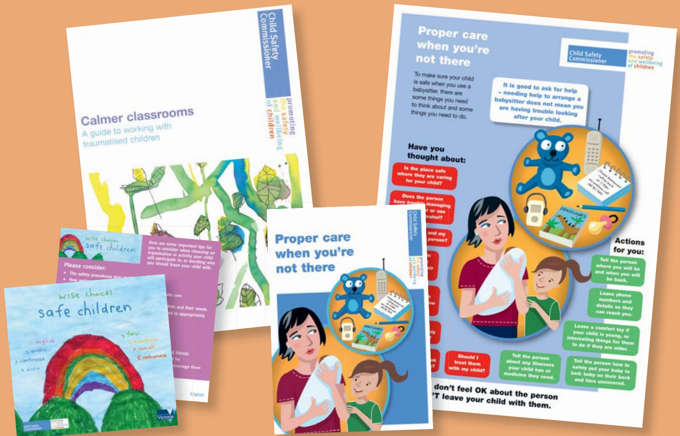
Left to right: Wise choices: safe children DVD and factsheet; Calmer classrooms – A guide to working with traumatised children ; Proper care when you're not there booklet and tip sheet.

in creating child-friendly and child-safe environments. The OCSC has distributed large numbers of the resources at various conferences and events. In addition, the office has experienced enormous demand for these resources through our online orders, via the OCSC website ( www.ocsc.vic.gov.au ), and through phone orders.